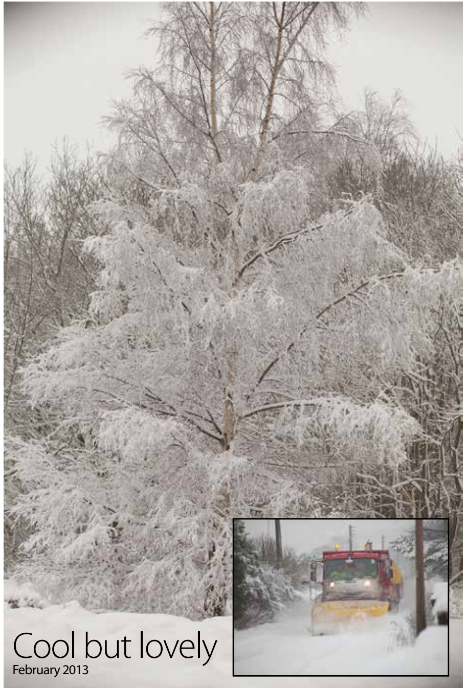
Cool but lovely February 2013

Deadline for the next Hunshelf Chat is 25 February 2013