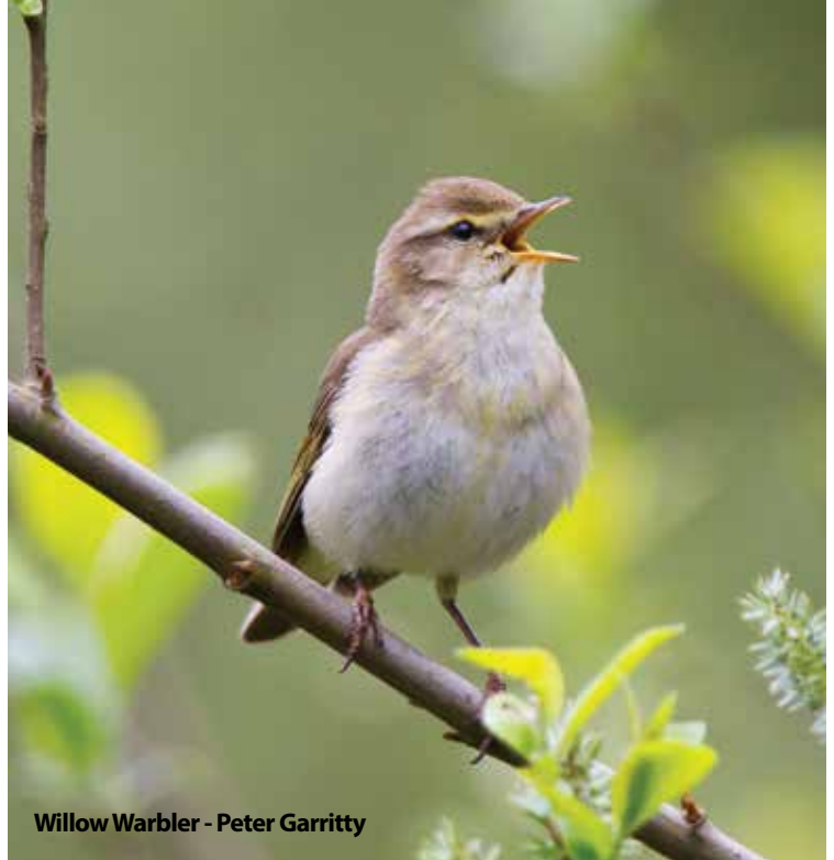
Willow Warbler