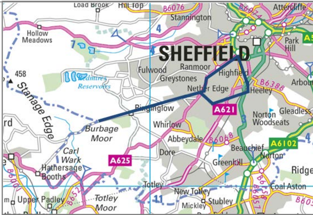
Figure 1. Location of the A22 Ecclesall zone.