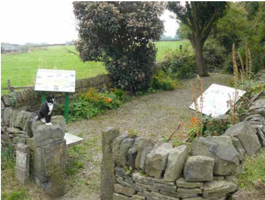
Green Moor Village Garden