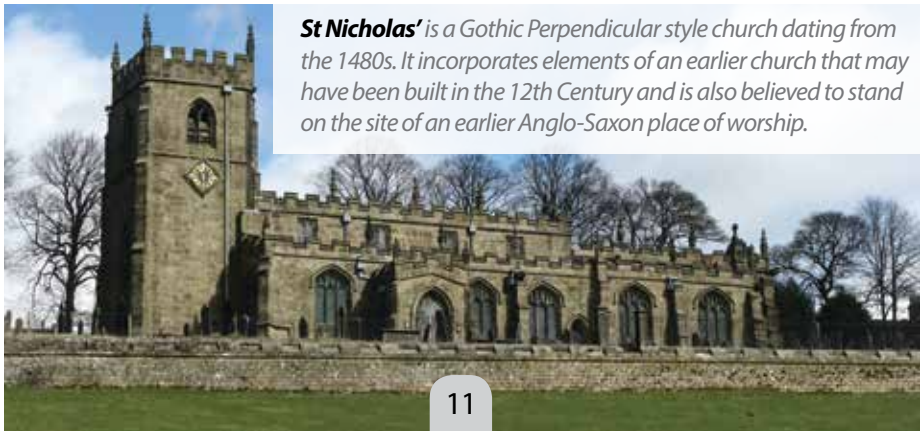
St Nicholas is a Gothic Perpendicular style church dating from the 1480s. It incorporates elements of an earlier church that may have been built in the 12th Century and is also believed to stand on the site of an earlier Anglo-Saxon place of worship.